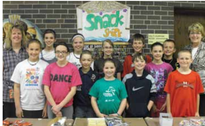
Students at John Paul II Elementary, Mitchell, S.D., raised money for Presentation mission work in Africa.