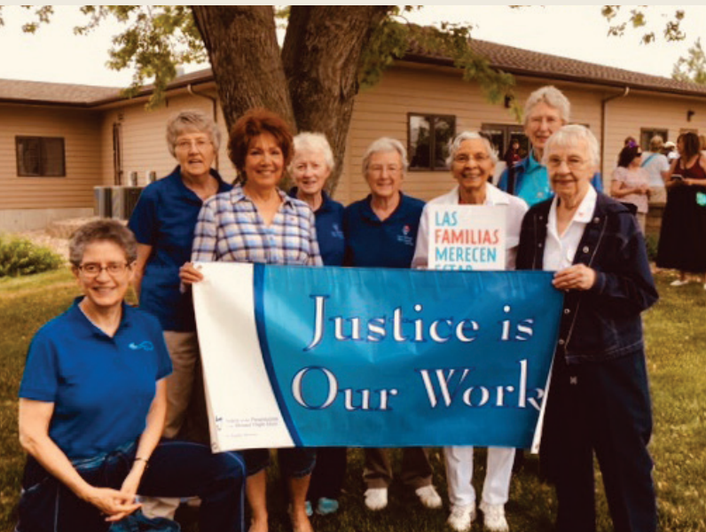
Sisters and Cojourners stood together in unity at a Families Belong Together rally in Aberdeen earlier this year.