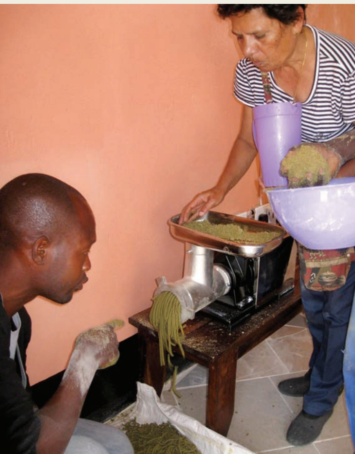
Below: We use local ingredients to make our own fish food for our Fish Hatchery.