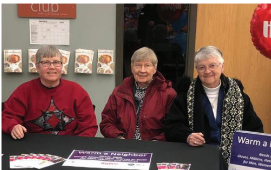
The annual Warm a Neighbor project invited the Sioux Falls community to join our Mission by donating winter items for the newly arrived immigrants to the area.