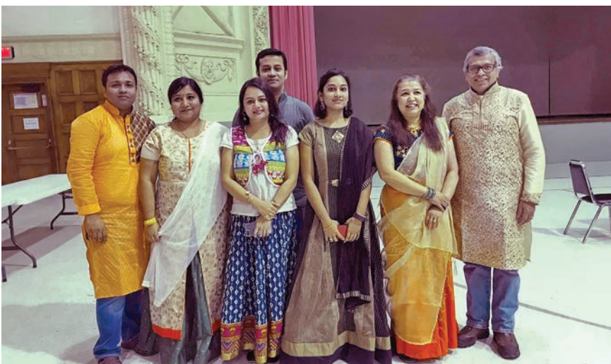
The first Sioux Falls area Prayer Bus Tour of 2019 shared the culture of India with participants.