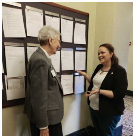
Sisters and partners continue to lobby in the SD legislature in support of more just policies for the common good.