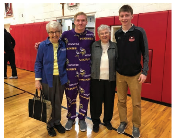
Sisters shared their vocation story by visiting with students at area schools during National Catholic Schools Week.