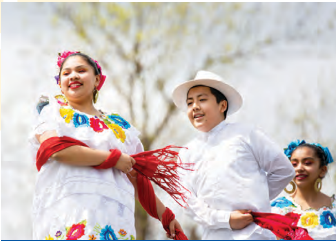
Cinco de Mayo Fiesta

This wonderful cultural experience is a way to welcome the newly arrived Latino immigrants and celebrate their rich heritage with the Sioux Falls community. The fiesta helps fund and support much of the work at Caminando Juntos each year and has grown to be a premier event in the region, drawing thousands of people to Falls Park. While there are many issues that divide our country today, the Cinco de Mayo Fiesta invites people of all backgrounds to come together to celebrate the culture and traditions of the Latino people, who have deeply enhanced our community and our nation.