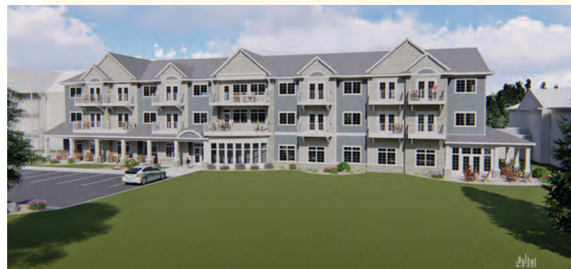
Render courtesy of Perspective, Inc.