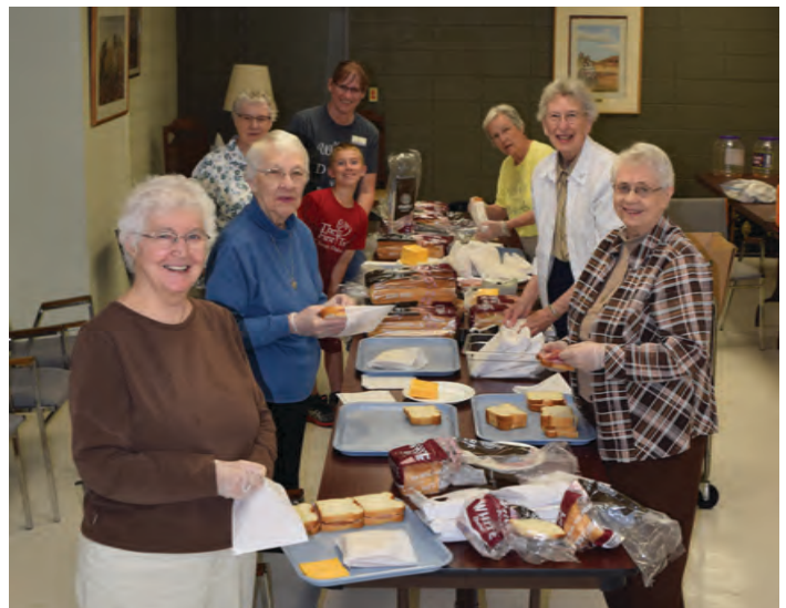
Salvation Army Programs for Kids

Each summer we partner with the Salvation Army as we take our turn, alongside other organizations, in providing a sack lunch for local kids. The Feed the Kids Summer Meal Program welcomes volunteers to prepare 250 sack lunches for low-income youth each week-day that are distributed at area parks. We were also fortunate to partner with others on a new Salvation Army program, Send a Kid to Camp/Pack a Suitcase Drive . The goal of the program is sending area kids to camp. A "Suitcase Drive" was held at the Convent, where members of the Aberdeen community were invited to bring a filled suitcase of camp supplies to be given to the campers.