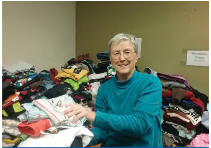
Providing Support at the Border

This wonderful cultural experience is a way to welcome the newly arrived Latino immigrants and celebrate their rich heritage with the Sioux Falls community. The fiesta helps fund and support much of the work at Caminando Juntos each year and has grown to be a premier event in the region, drawing thousands of people to Falls Park. While there are many issues that divide our country today, the Cinco de Mayo Fiesta invites people of all backgrounds to come together to celebrate the culture and traditions of the Latino people, who have deeply enhanced our community and our nation.