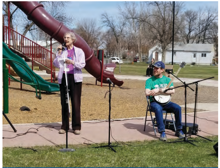
Celebrating Earth Day

We strive to joyfully incarnate the compassion and justice of Jesus, as our foundress Nano did, so that our neighbors locally and globally might live with hope. We welcome the partnership of others in these efforts as we work together spreading the Gospel message through celebrations, public awareness building and hard work. Our Mission guides our ministry and underlines our spirituality. Our focus on promoting justice and alleviating oppression helps us to determine which of the many needs of God's people we might best be able to meet through our ministry efforts. This guidance is essential as we minister to those in need all over the world. 🌟