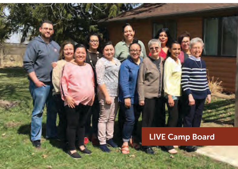
LIVE Camp Board

I said 'yes' because I have felt His presence there in the middle of vespers, on the long walks to and from the cabins, in the praises and songs we sing and more specifically in the hearts of these girls who have tears in their eyes when they leave this camp. We have changed hearts and minds, we have created a family of Latinas who have the opportunity to create a real relationship with God and be with other strong women who have chosen to be leaders and LIVE in HOPE, LOVE and FAITH. ◆