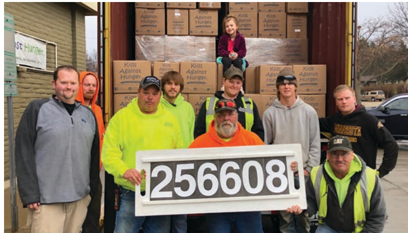
Kids Against Hunger packaged meals in South Dakota, providing nourishment for our sisters and brothers in Africa.

need. Finally, our donors continue to support our work by setting up an emergency fund for those most in need and giving to our education fund to pay school fees for high school and college students. ●