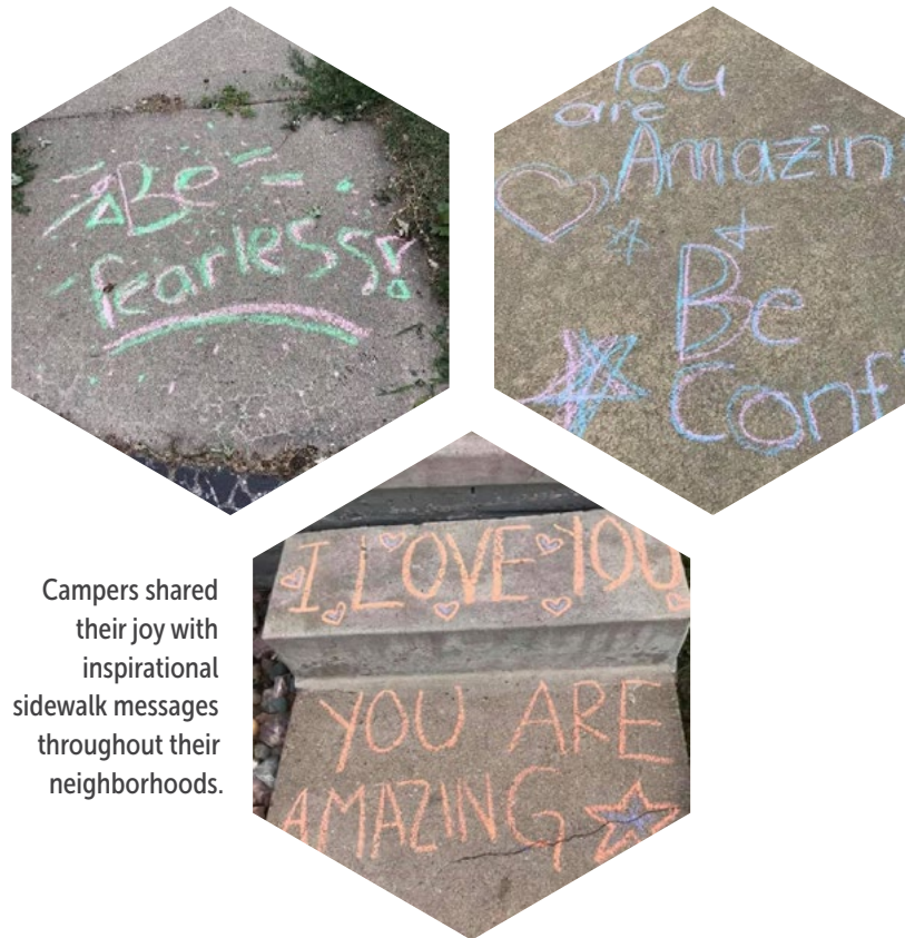
Campers shared their joy with inspirational sidewalk messages throughout their neighborhoods.

In partnership to further the LIVE Camp into the future, we are excited to actively work with a new board and 501(c)3 that will support and enhance this camp for years to come. We feel this new, 100% Latino board will make an even greater impact in Omaha and the Latino community. In this transitional time, we continue to support, collaborate and assist in financing the LIVE Camp. We are grateful for the partnership of foundations, businesses and individuals who continue to support and believe in this camp. Gifts of any amount will be used for scholarship assistance. This helps us to keep the camp registration fees at a minimum, allowing all to attend, regardless of economic status.