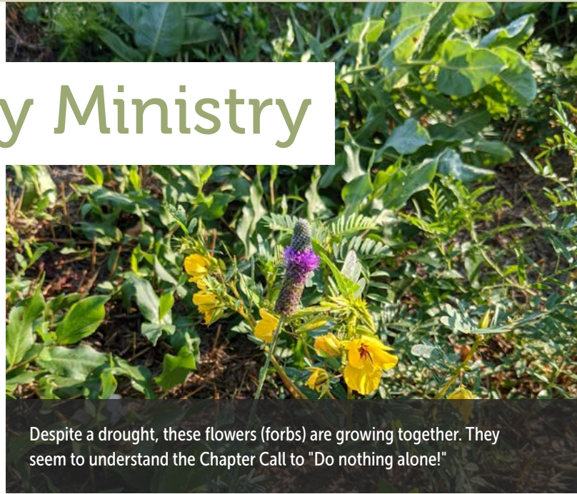
Despite a drought, these flowers (forbs) are growing together. They seem to understand the Chapter Call to "Do nothing alone!"

We are also in partnership with EcoSun Prairie Farms, an expert in the native grasslands of South Dakota. Together, we have completed a planting of native vegetation. EcoSun has been supportive in teaching us how we can revive the beautiful native grasses and forbs that grew naturally around Presentation Heights which is located on the ancestral homelands of the Oceti Sakowin (pronounced O-Cheh-tee Shah-ko-ween),