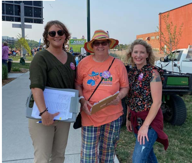
Gathering signatures at the Levitt outdoor venue in downtown Sioux Falls in an effort to end gerrymandering in South Dakota.

Beyond Presentation connections, we also partner with The Banquet, St. Francis House, Salvation Army, Bishop Dudley House, Aberdeen Area Diversity Council, Feeding South Dakota and others to reach those in need of a helping hand, expressing and showing compassion as they face injustice in their lives. By raising awareness and exploring opportunities to make changes, we help others to recognize injustice around them and to act, building our collective capacity to respond to the most critical needs. ◆