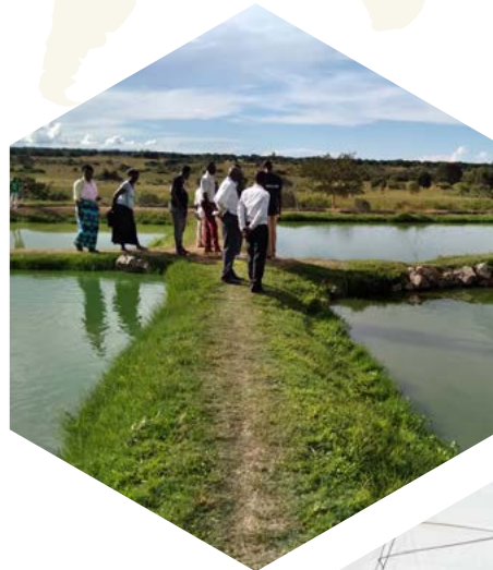
◀ Visitors learning about fish farming.