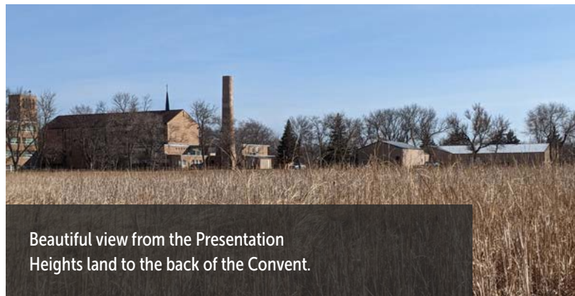
Beautiful view from the Presentation Heights land to the back of the Convent.

meaning the “Seven Council Fires” of the Lakota, Dakota, and Nakota people, also known as the Great Sioux Nation.