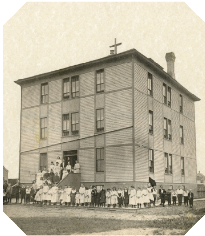
Our First School - The Presentation Academy of the Sacred Heart of Jesus

College, a vibrant internship program and the educational components of our ministries carries on our belief that education is the key to a just, merciful and compassionate world, now and in the future. ◆