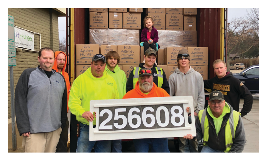
Kids Against Hunger packaged meals in South Dakota, providing nourishment for our sisters and brothers in Africa.

need. Finally, our donors continue to support our work by setting up an emergency fund for those most in need and giving to our education fund to pay school fees for high school and college students.