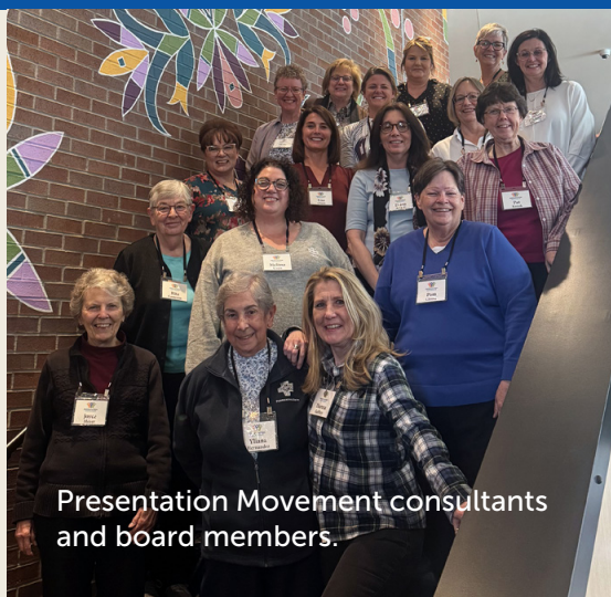
Presentation Movement consultants and board members.

The Presentation Movement will create and foster a network of individuals who, through their unique gifts and passions, will build a more just world through compassion, education, spiritual reflection and service to those most in need.